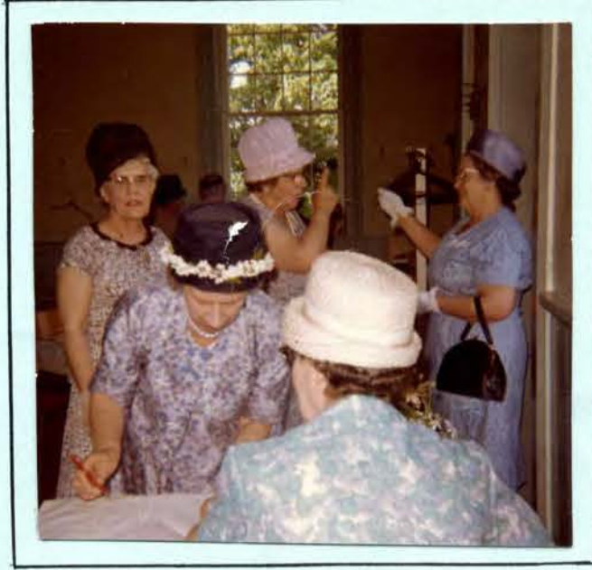
A "June Tea" -