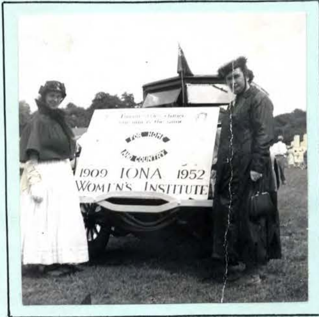
"Though styles change, Our aim is the same."

Many of the twenty-seven presidents and twenty secretary-treasurers were overly generous with their time and talents, as noted above, by the number of times the offices were held by these women who served their organization along with the other members, who, no doubt, were just as active.